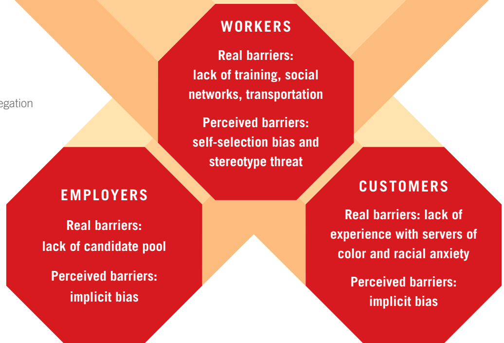
FIG 2 Real and perceived barriers impacting occupational segregation in the restaurant industry.

ers who were “clean-cut,” had “good hygiene,” or a “professional” appearance, all potential code-words for race, and the majority expressed that there were no barriers to hiring or mobility except for language skills. The majority denied that race was an issue, while some felt it was an issue in the industry for others but not for them, and only two thought it was an issue they faced. The restaurant owners and General Managers interviewed varied in their opinion towards the cause of segregation, and stated that a lack of diversity was either not a problem, or was caused by self-selection, and a lack of self-esteem, among the individuals who applied to certain positions, by education and language barriers, by a lack of family structure and work ethic, or by the legacy of slavery that made African Americans unwilling to work as servers.